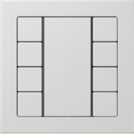
F 50 sensor, 4-gang