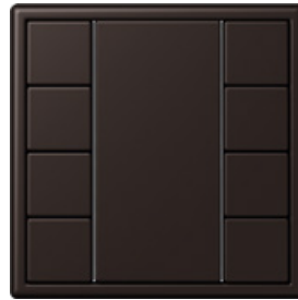
F 50 sensor, 4-gang