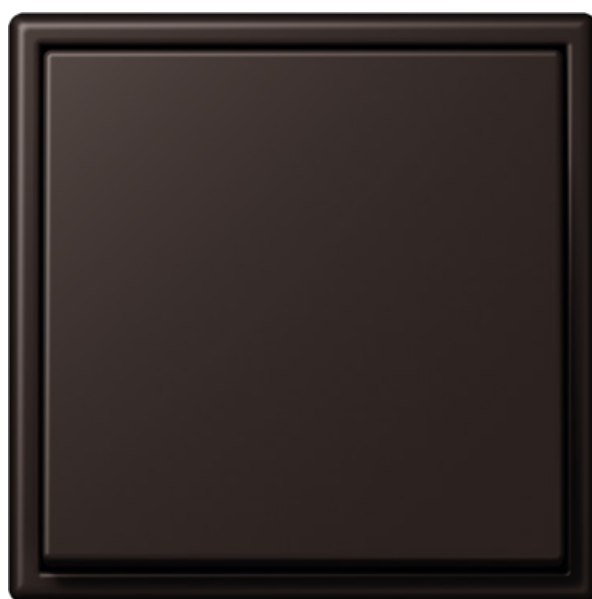
4320J TERRE D'OMBRE BRÛLÉE 59

In its LS 990 range, JUNG is the only manufacturer worldwide to supply switches and frames in the 63 timeless Les Couleurs® Le Corbusier colours created by the famous architect. All these colour shades harmonise with each other. With this especially broad diversity of design, the Les Couleurs® Le Corbusier colours enable a powerful interior design impression to be created with the classic LS 990 switch range.