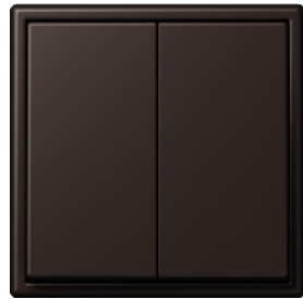
F 40 sensor, 4-gang