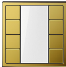
F 50 sensor, 4-gang