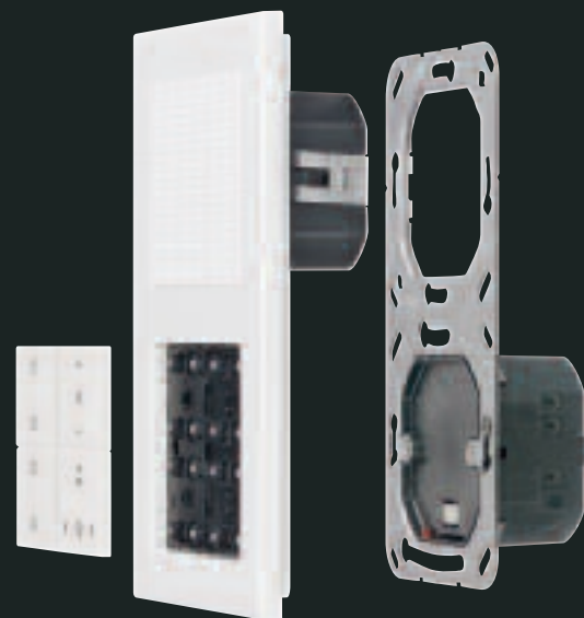
Simple installation – thanks to the prewired and preassembled components

The operation of the JUNG radio is carried out simply and conveniently via the four large push-buttons which are assigned the functions "ON/OFF, sleep mode and station scan", "Volume", "Memory 1 and 2" and "Memory 3 and 4". The additional status LEDs in blue and red further optimise the handling of the device.