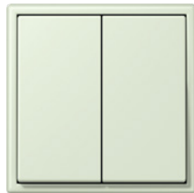
F 40 sensor, 4-gang