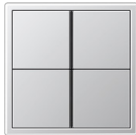
F 40 sensor, 4-gang